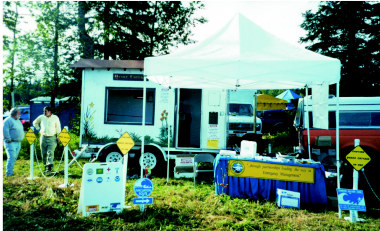
Figure 3: In 2000, the Quake Cottage went to three state fairs.

tion and re-digitizing had to be completed by scientists from TIME and the University of Alaska Fairbanks, Geophysical Institute throughout the modeling process for Kodiak. The Multi-agency Tsunami Work Group visited Kodiak prior to and upon completion of the modeling process to determine the expectations and to validate and refine Kodiak's commitments; and now Alaska's first accurate tsunami inundation maps are being used on Kodiak Island. A tsunami annex has been added to Kodiak's emergency plan, evacuation routing has been identified, tsunami signs have been posted, and efforts are underway to link construction standards with inundation zones.