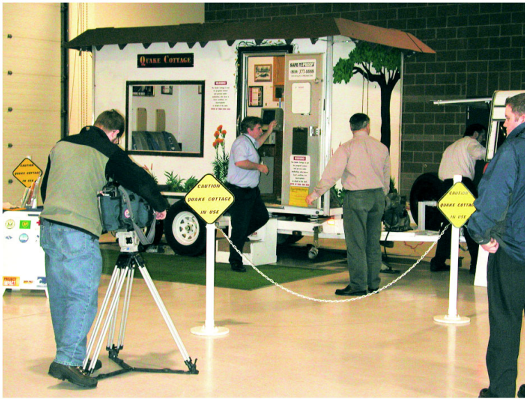
Figure 2: The Quake Cottage.

calized; i.e., same format, same message, but some community-specific information. To that end we developed a Tsunami Hazard Warning—Interpretive Sign template to enable customizing while minimizing expense. As community based partners and sponsors vary, so can the sign configuration. They may be further customized with historically significant photos of prior events. The signs are placed in state parks, boat harbors and other community designated locations (Fig. 4).