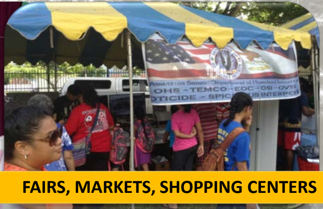
FAIRS, MARKETS, SHOPPING CENTERS